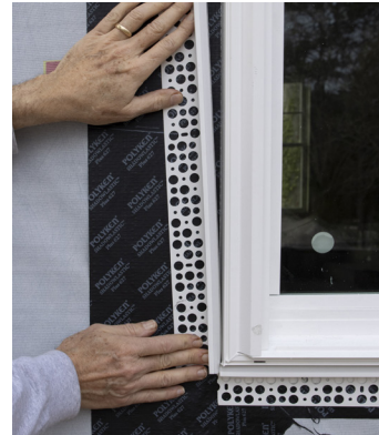
Reduce Labor, Eliminate Caulking and Drastically Reduce Your Installation Costs