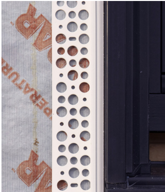
SPEED BEAD's Integrated Flexible Bulb Creates a Waterproof Seal Eliminating the Need to Caulk